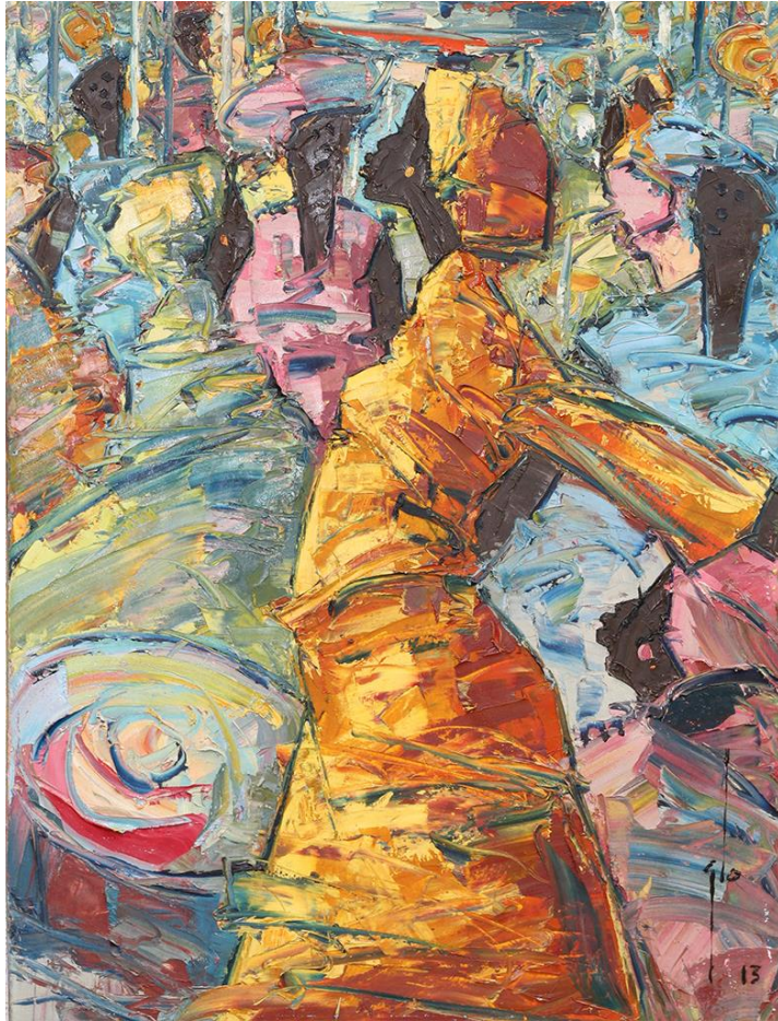
Market Watch, 2013