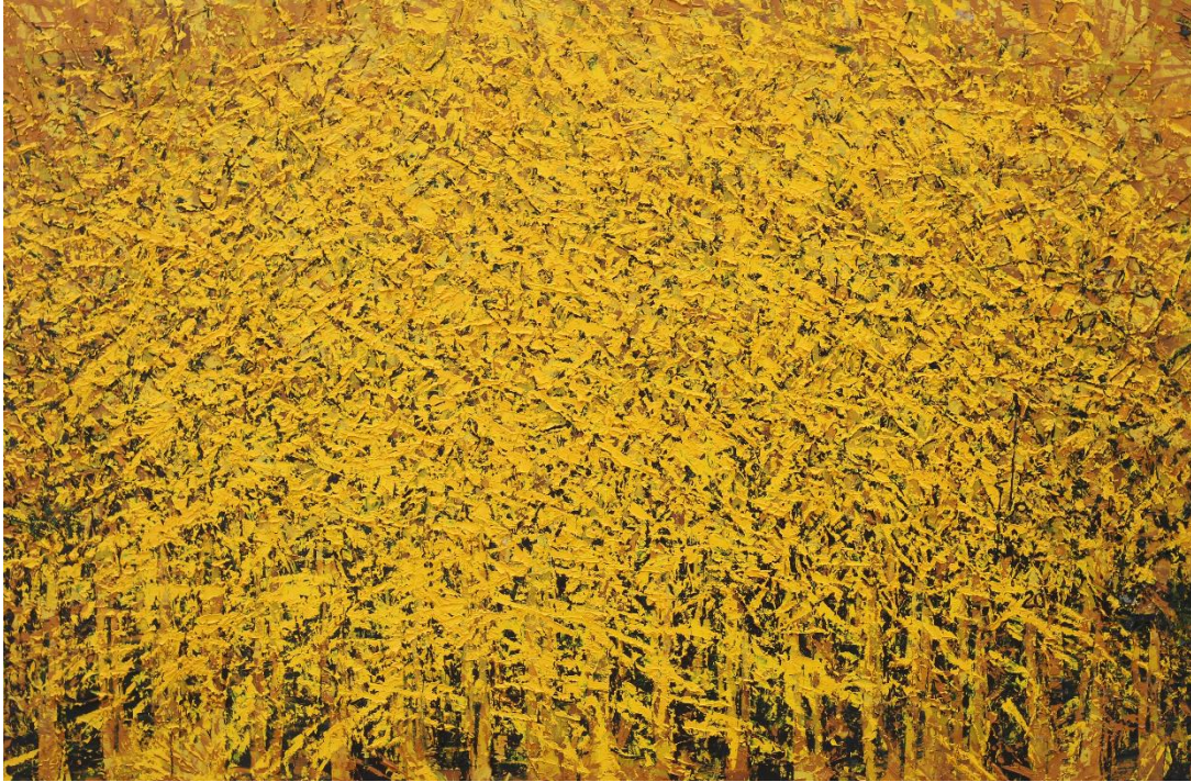
Yellow Forest, 2020