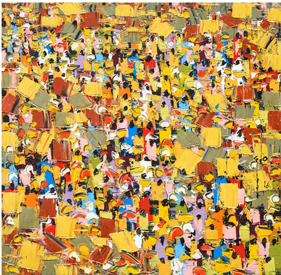
Open Market, 2016