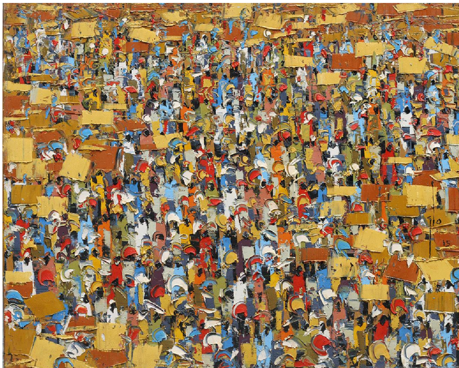
Open Market, 2015