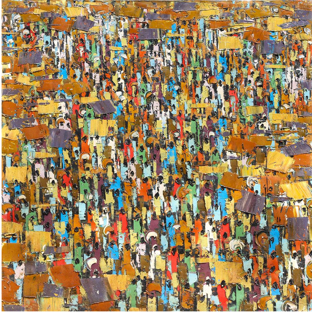
Open Market, 2011